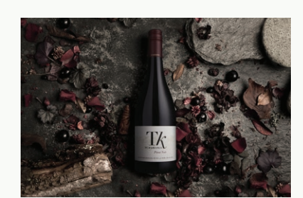
Te Kairanga Martinborough