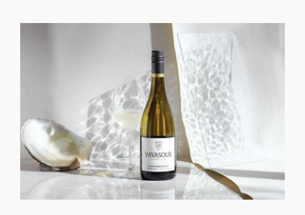
Vavasour Awatere Valley, Marlborough