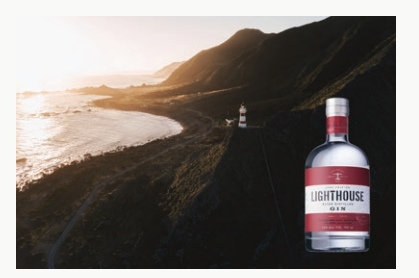
Lighthouse Gin Martinborough