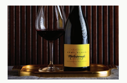
Martinborough Vineyard Martinborough