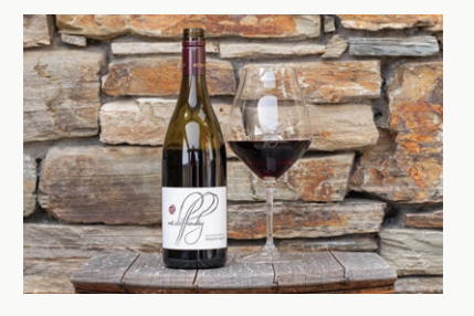
Mt Difficulty Central Otago