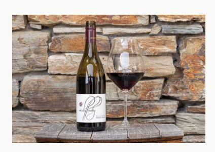
Mt Difficulty Central Otago