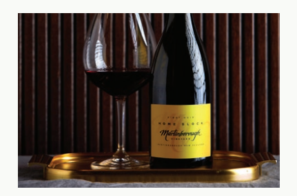
Martinborough Vineyard Martinborough