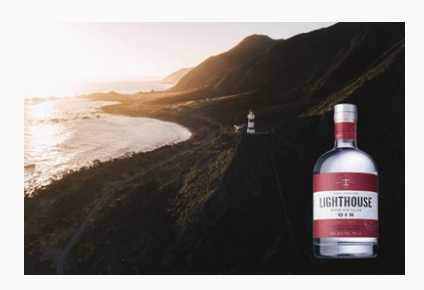
Lighthouse Gin Martinborough