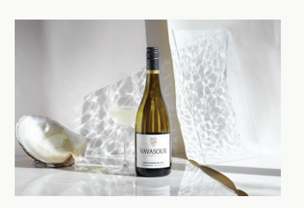
Vavasour Awatere Valley, Marlborough