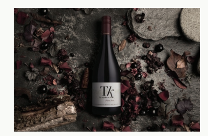
Te Kairanga Martinborough