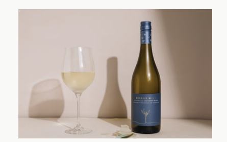
Grove Mill Wairau Valley, Marlborough